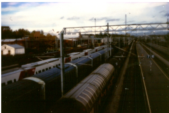
05. RAILWAY STATION