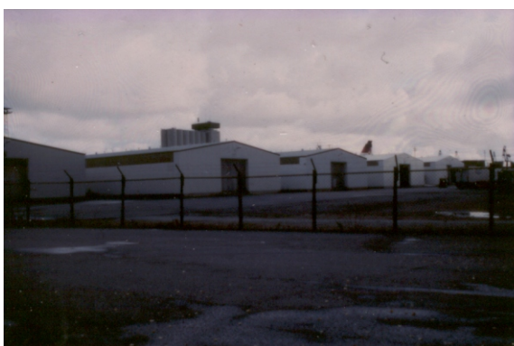
06. MILITARY COMPOUND